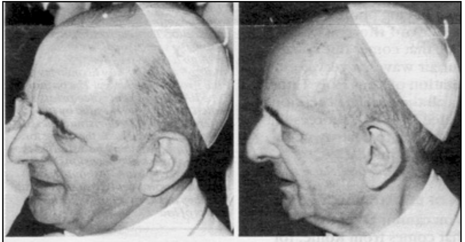
Note the prominent birthmark between the eye and ear of the true Pope (on the left, 1973 photo) and conspicuously absent on the impostor (right, 1977 photo). Notice the visible difference in the nose. Pope Paul has a longer, straighter, more pointed nose. The impostor has a shorter and rounder nose.